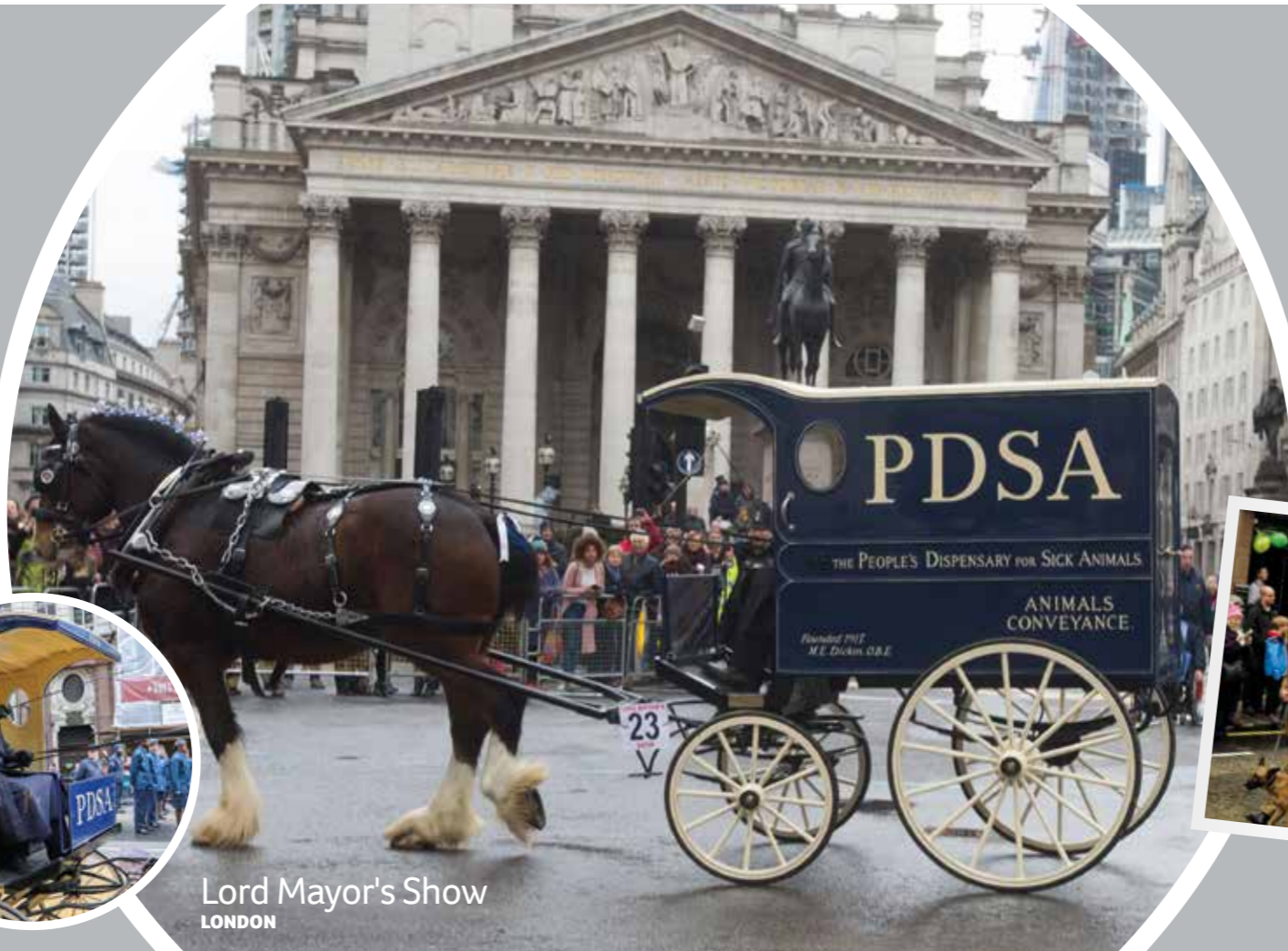
Lord Mayor's Show LONDON

Our horse-drawn carriage returned to London's streets