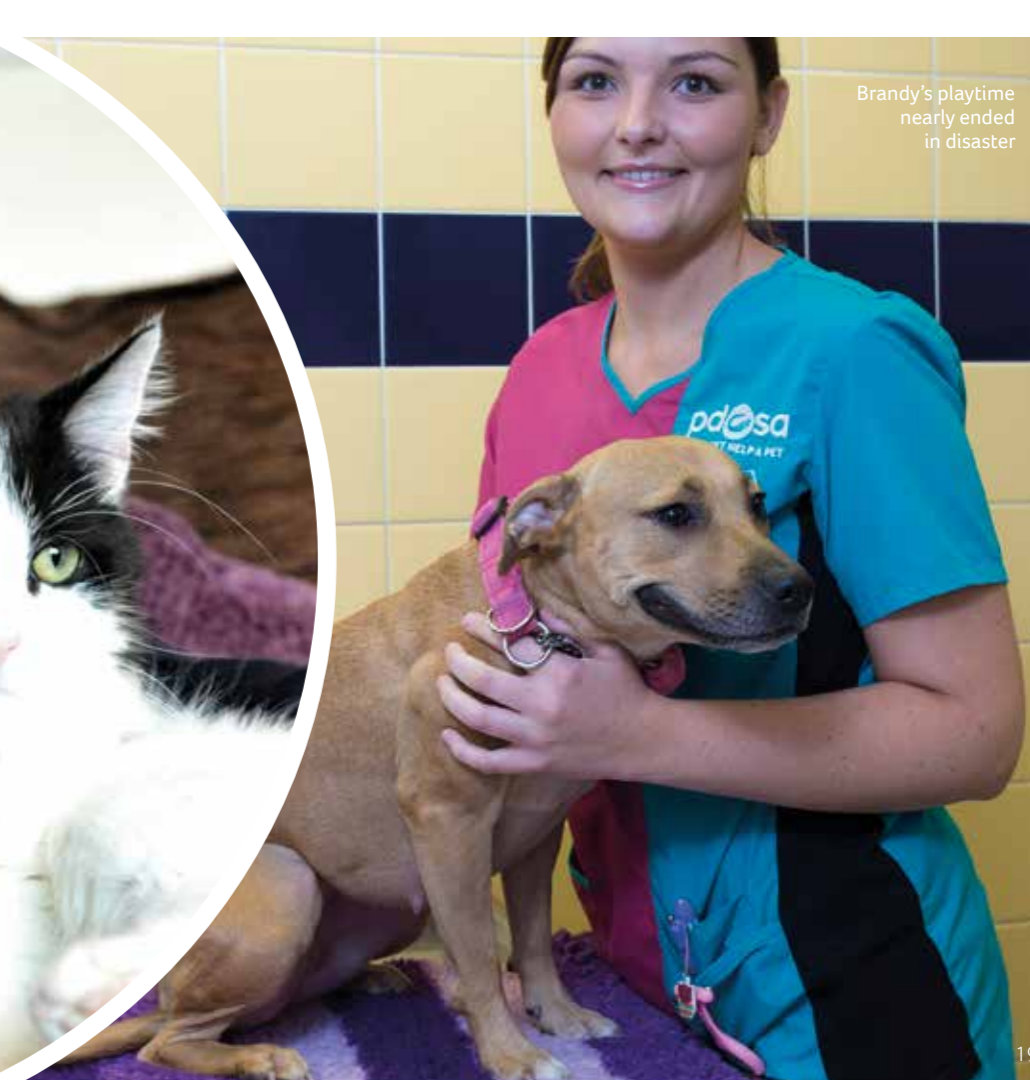
Brandy's playtime nearly ended in disaster