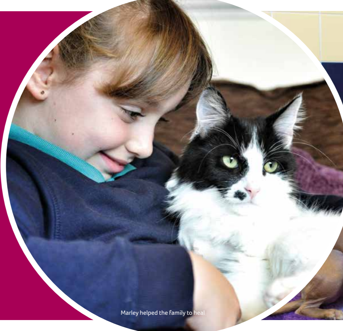
Marley helped the family to heal