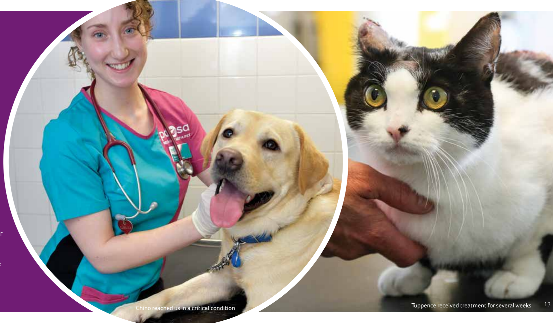
Chino reached us in a critical condition